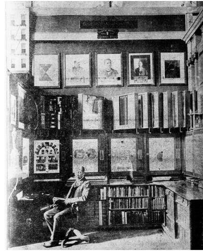
Figure 1: Poster for the Paris Exhibition of 1900 (left) and W.E.B. Du Bois sitting at his exhibit (right).

exhibitors have tried to show: (a) The history of the American Negro. (b) His present condition. (c) His education. (d) His literature. (Du Bois (1900), p. 576).